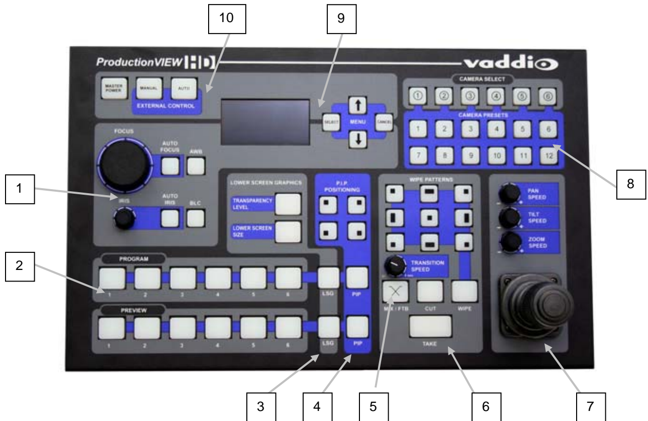
Figure 2: ProductionVIEW HD with key features highlighted