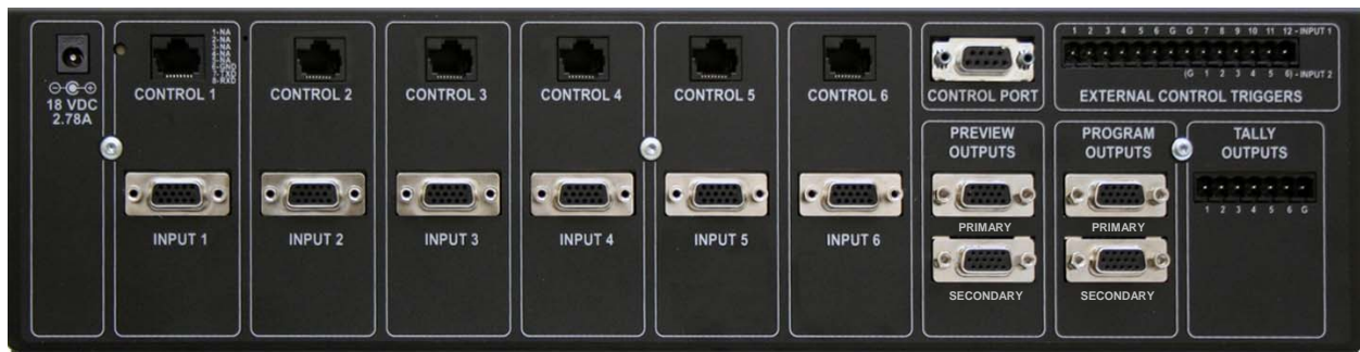
Figure 3: Back panel section of ProductionVIEW HD